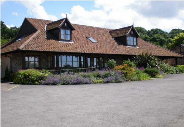
Pic. 4 The Surgery and Church Rooms