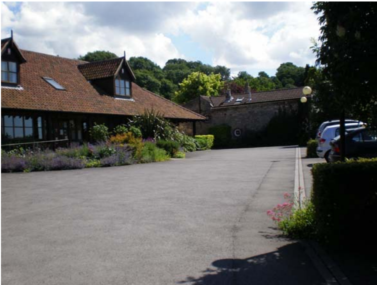
Pic.5 Park the car on the right hand side