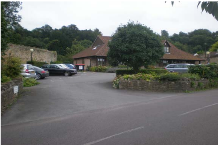
Pic.3 Turn to the Surgery and Church Rooms