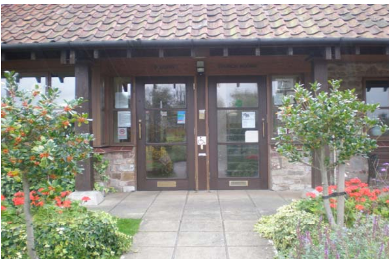
Pic.6 Church Rooms door on the right, up the stairs, turn left enter the door on the end of the corridor in front of you.