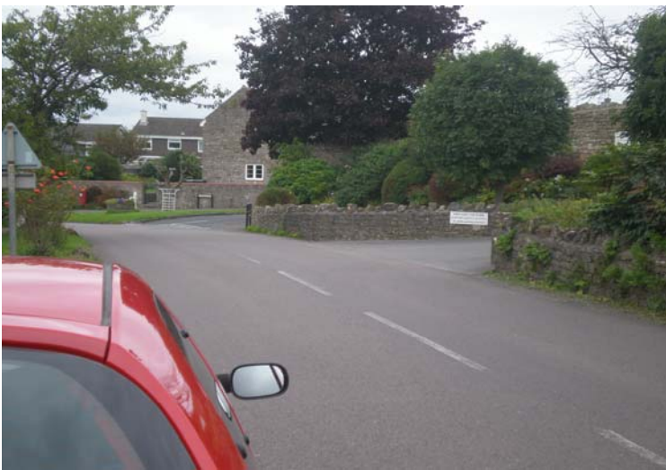
Pic.2 Approaching turn right to the Surgery and Church Rooms